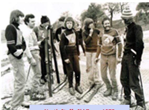
North Staffs Ski Team 1975

2024 marks the 50 th year of skiing in Kidsgrove. In this edition of the newsletter, we take a brief look back over the last fifty years at how the club has developed.