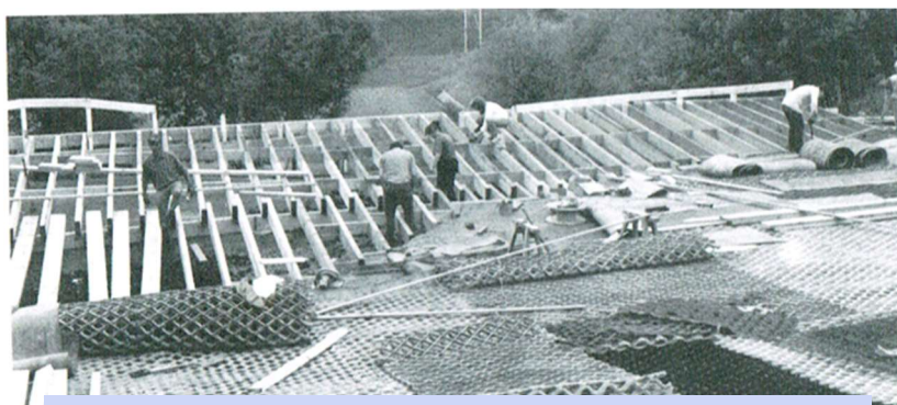
A photo showing the construction of the bottom platform in 1988/89

Finally, in 1987 the matting reached the steepened top of the slope. The long worked on home-made ski lift became operational in March 1988 (which lasted with a lot of tender care until 2014).